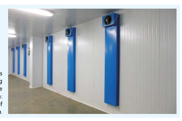
for de-grading the temperature inside the room: ensure uniformity of germination.