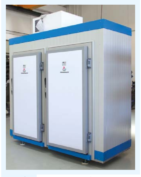
Room for the preservation of seeds .

Prefabricated isothermic rooms with advanced technical solutions.