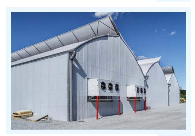
Integration of a germination room inside a greenhouse.