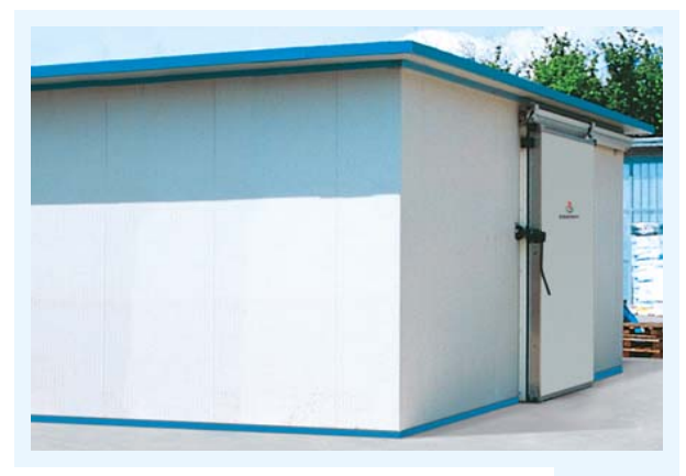
Outside germination room with manual sliding door.