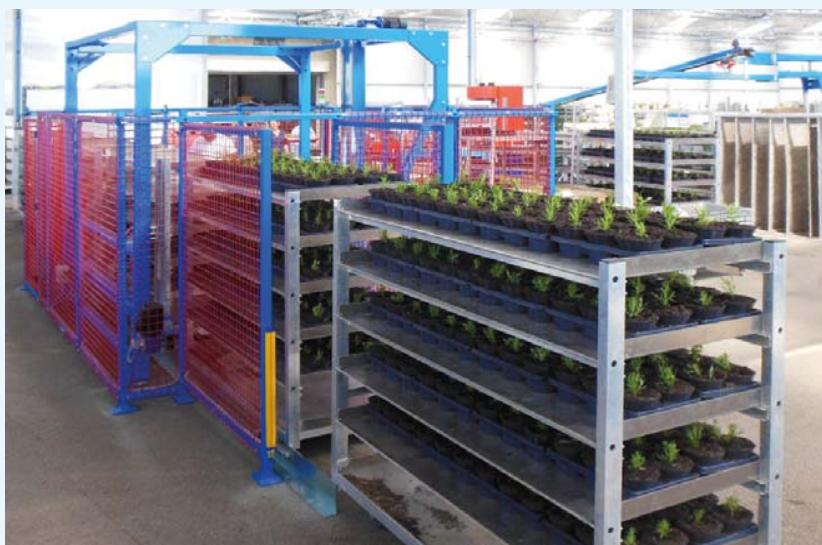
Trolleys exit .