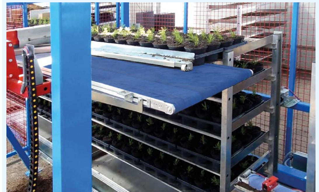
Pots loading phase on the trolley shelves.