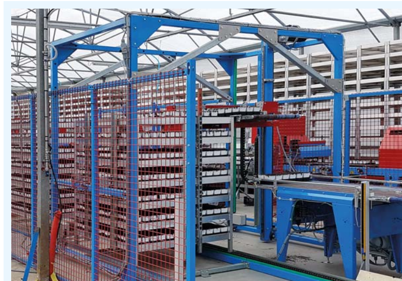
Trolley in the frame version with advancement system with chain.