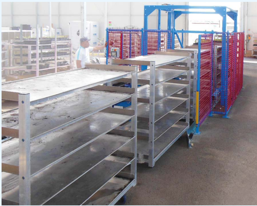
Empty trolleys entry .