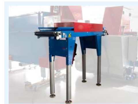
NTV belt with special legs and high side boards for the soil transport.