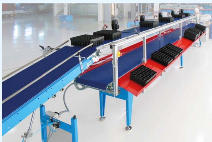
NTV belt with pneumatic inclination : it can be aligned to the upper shelf for transplanting or the lower for transport only.