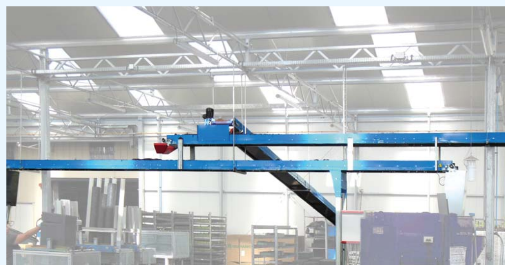
Suspended NTV belt for the soil transport : maximum performance with the minimum floor overall dimensions.