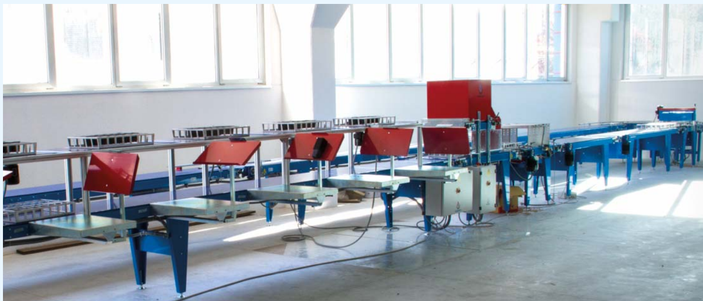
Cuttings transplanting line with NTV conveyor belts.