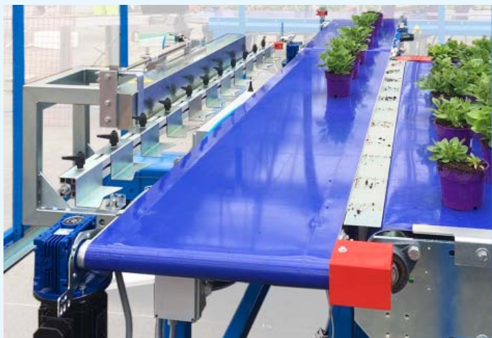
Adjustable pusher fork.