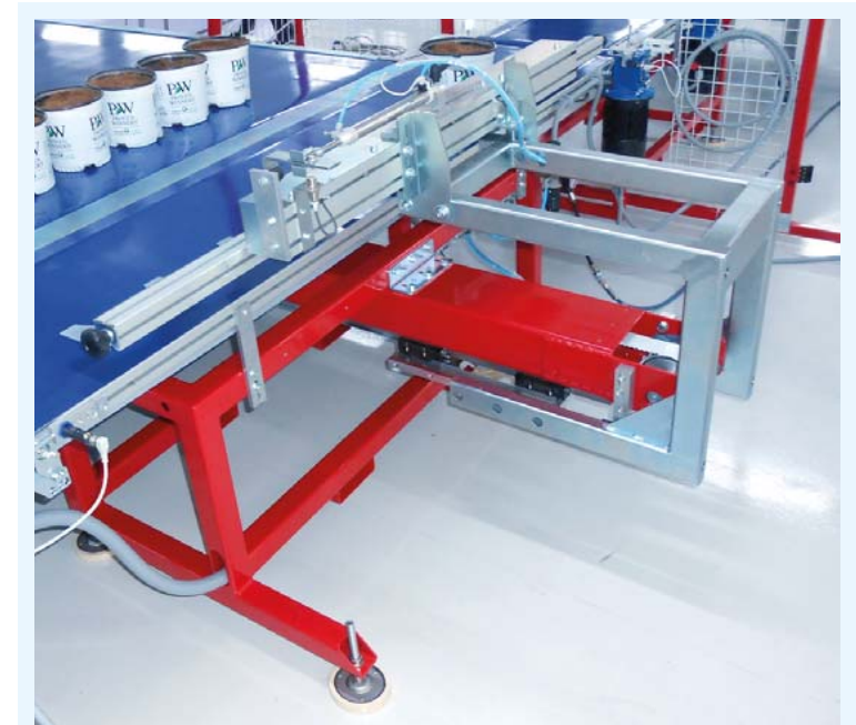
Pots pusher with 500 mm stroke with electric control and pneumatic stagger (up to 250 mm).