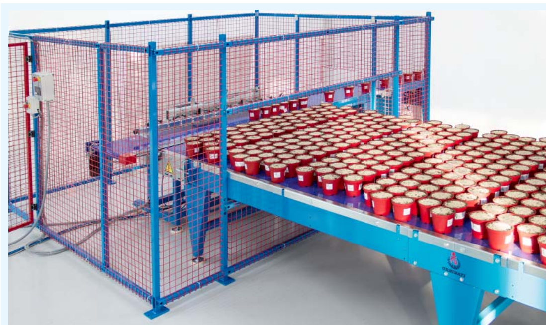
The positioning of the pots on the belt can have a staggered or squared pattern.